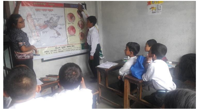
Giving instruction about the ear health in different class