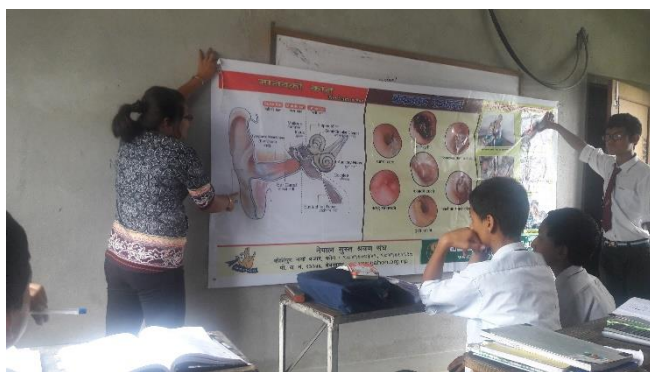
Giving instruction about the ear health in different class