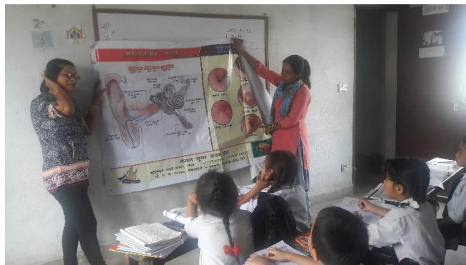
Giving instruction about the ear health in different class