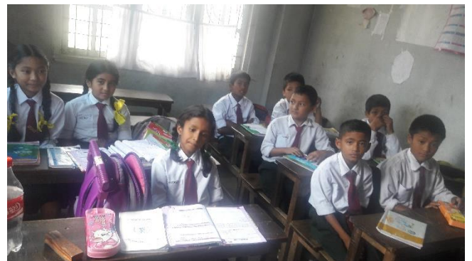
Giving instruction about the ear health in different class