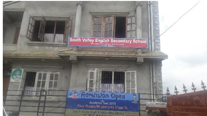
Where we did school health program